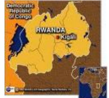
Location in Africa of Kigali, Rwanda

“Very rarely do we have an opportunity to heal so many, and this conference is only $50 per person!”