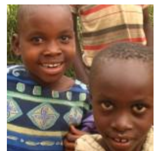
Children of Kigali