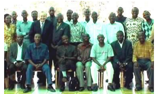
Pastor's gathering in Rwanda

ChangePoint's mission is to bring spiritual healing and renewal to individuals with wounds in their past and pain in the present through healing prayer counseling which includes the healing power of forgiveness, ministering to individuals and in group settings.